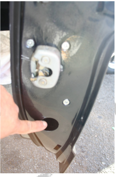
These are the rear bolts BELOW the

latch assembly. One is hidden usually behind a round plug.