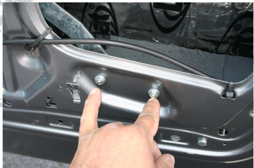
This is the

latch assembly. One is hidden usually behind a round plug.