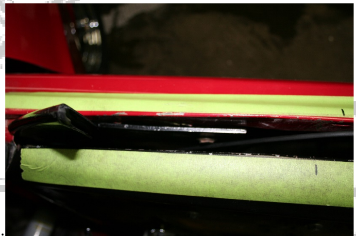
The first triangular

the way down so you can install the Allen bolt for the install of the first part of the Front triangular bracket. (Don't fully tighten you still need to slide the corner bracket in.)