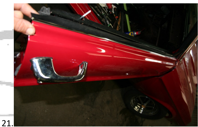
Install the new

Scrapers. You will notice two short scrapers (inner), and two longer scrapers (outer). They will be clipped for ease of install. In the triangular brace area you can use <u>3M weatherstrip adhesive</u> preferably black to secure the unclipped area.