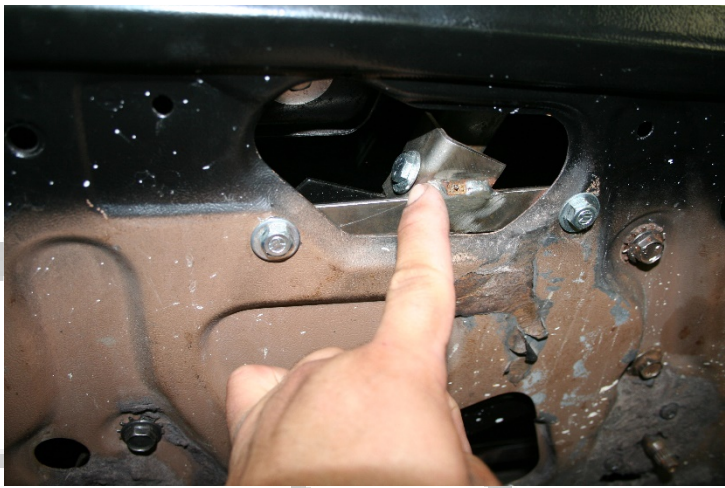
This is another

adjustment point on the front upper vertical guide. It can slide in and out.