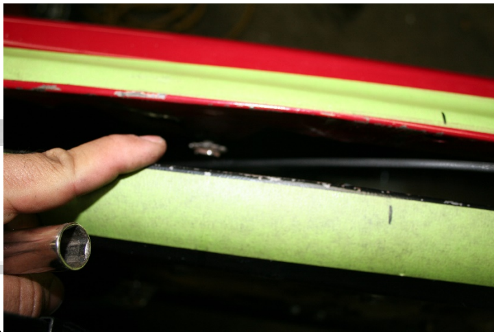
Lower the glass all

the way down so you can install the Allen bolt for the install of the first part of the Front triangular bracket. (Don't fully tighten you still need to slide the corner bracket in.)