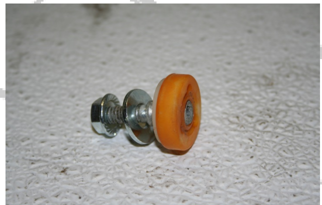
New Square White Rollers included, for our New Roller channel. Two per regulator, 8 for both vertical guide rails and Regulators. 4 will already be mounted to the glasses. Quantity (4per door, 8per kit)

Bag of ¼"&<sup>5/16</sup>" Nuts, bolts& washers