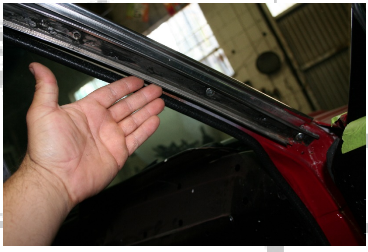
You will be shifting it

the old vent glass met the door glass, peal and separate the roof rail seal and remove the screws the hold the metal channel to the body.