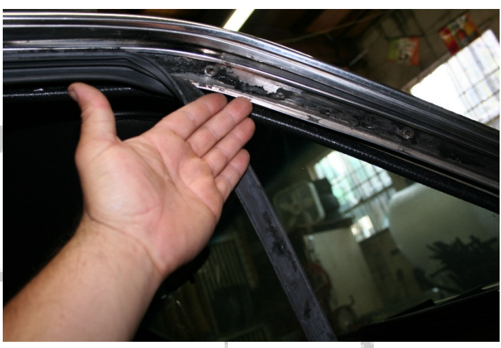
In the area where

the old vent glass met the door glass, peal and separate the roof rail seal and remove the screws the hold the metal channel to the body.