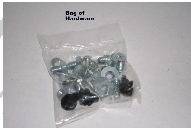
adjustment bolts. Quantity (1bag)

Bag of ¼"&<sup>5/16</sup>" Nuts, bolts& washers