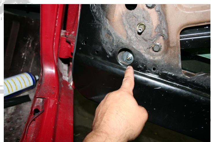
This is the front

lower adjustment bolt. By turning it RIGHT you are pulling the top of the door glass when up away from the roofrail seal. By turning it Left you are bringing the glass closer to the roof rail seal, where it belongs.