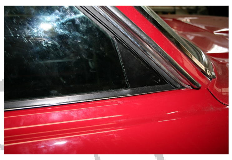
This is what the final

adjustment should look like, with the Roofrail seal pressing up against the back of the glass.