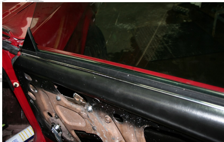
Follow the same

Scrapers. You will notice two short scrapers (inner), and two longer scrapers (outer). They will be clipped for ease of install. In the triangular brace area you can use <u>3M weatherstrip adhesive</u> preferably black to secure the unclipped area.