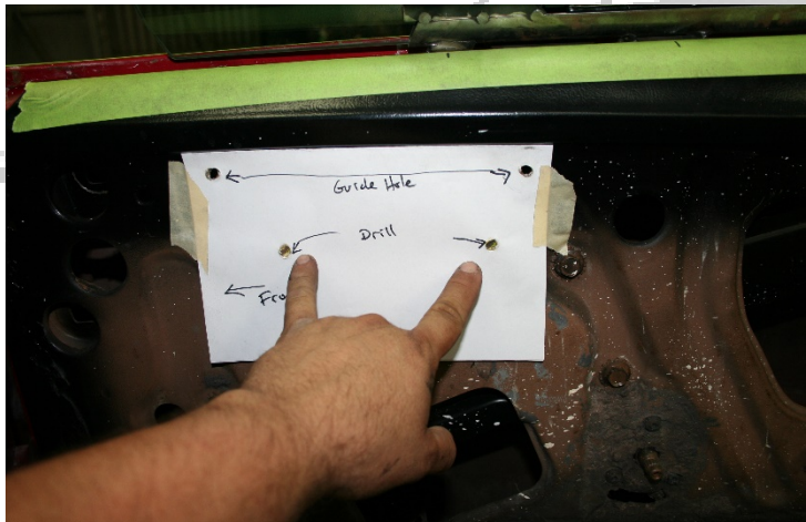
10. You will have to drill

the front Vertical Guide, you must roll the glass as far up as possible, you will notice the Front rollers attached to the glass come past over the scraper line. You can now proceed and slide the front V guide up from the bottom. Slowly bring the glass back down into the door and make sure the roller is in the channel.